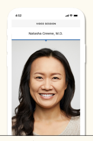
Therapy + psychiatry

Our library of clinically-validated resources includes activities, articles, classes, podcasts, and more. In-app content is tailored to your needs and available anytime to help you build skills and work towards your goals.